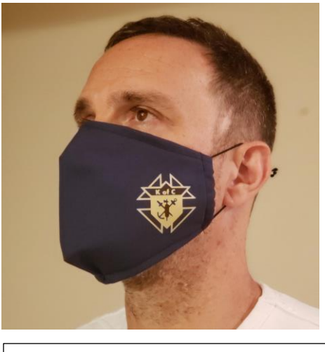
Comes in three sizes: S, M, L Adjustable ear straps Hand washable

To purchase your own Knights of Columbus reusable mask, please contact Keri Van Gemert at (904)325-1903 or aautoinsurance@outlook.com