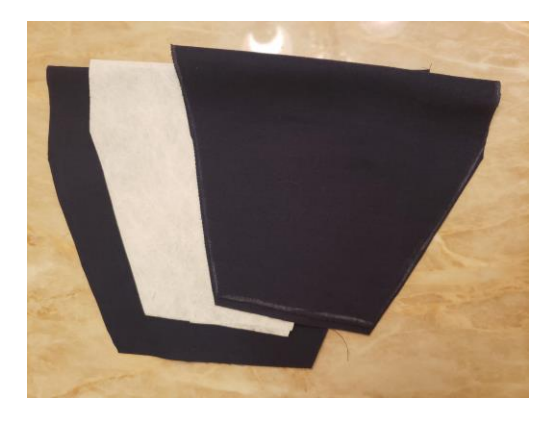
Two outer layers of 100% cotton material for comfort and one inner layer of polypropylene material.

The Ladies Auxiliary upon learning of this, reached out to the Director of the Council on Aging, and to their delight, offered to produce 100 reusable masks that are hand washable. To date, the Ladies have produced 30 reusable masks and are in need of the materials used to produce the rest of these masks, therefore, the Ladies are producing reusable masks for the Knights at $8 per mask. The $8 will not only cover the cost of the Knights mask, but also the cost of producing and donating two generic masks for the St. John's County Council on Aging. Each mask has three layers of material, two layers of 100% cotton material and one layer of polypropylene material.