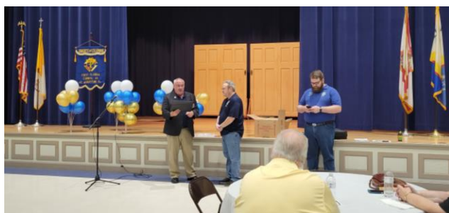
State Deputy Robert Urrutia presenting the Council with a letter of recognition celebrating the Council's 120 th Anniversary from the Florida State Council