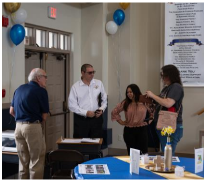
Greeting guests and 50/50 raffle tickets