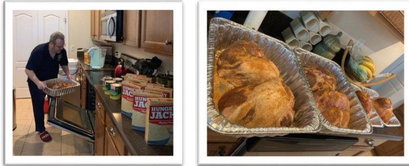
Grand Knight Gabe Oti preparing meals to feed 100 for Homeless Ministry