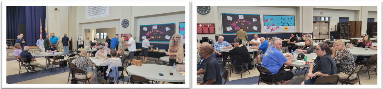
Council members and guests enjoying good food and great fellowship