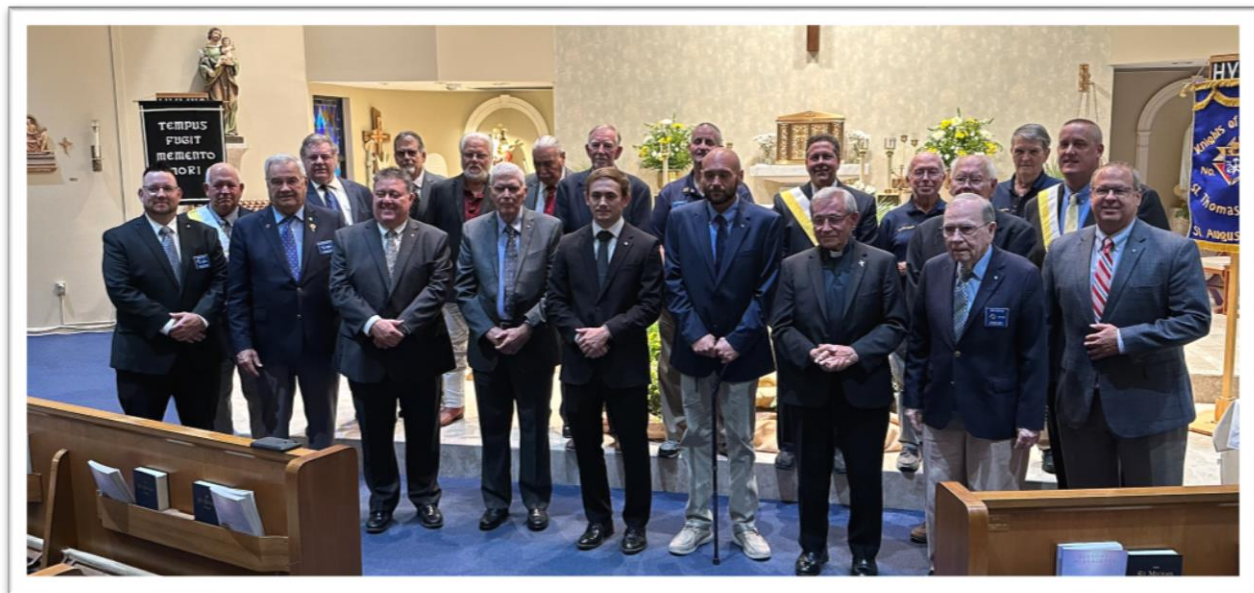
Group photo of all brothers from Councils 611, 11046 and 13337 that attended the Exemplification prior to the dinner reception with members and their families